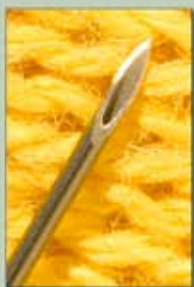
Ordinary Aramid Knit

TurtleSkin fabric has been to Mars and was also chosen by NASA for use on the space shuttle. Our patented weave is the tightest ever achieved with rugged, cut resistant aramid fiber - effectively preventing fine penetrators from passing through the TurtleSkin fabric.