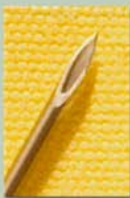
TurtleSkin Fabric Weave