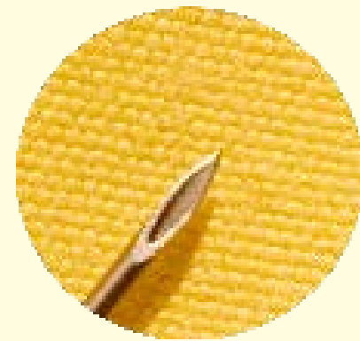
28g Hypodermic Needle on patented TurtleSkin fabric

TurtleSkin gloves are lined with a patented, high-strength woven fabric that is not only breathable but also stops hypodermic needles, syringes, knives, and razors. This patented weave is the tightest ever achieved with aramid fibers, effectively preventing fine penetrators from passing through the fabric.